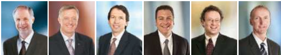
Robert P. Dexter Chair