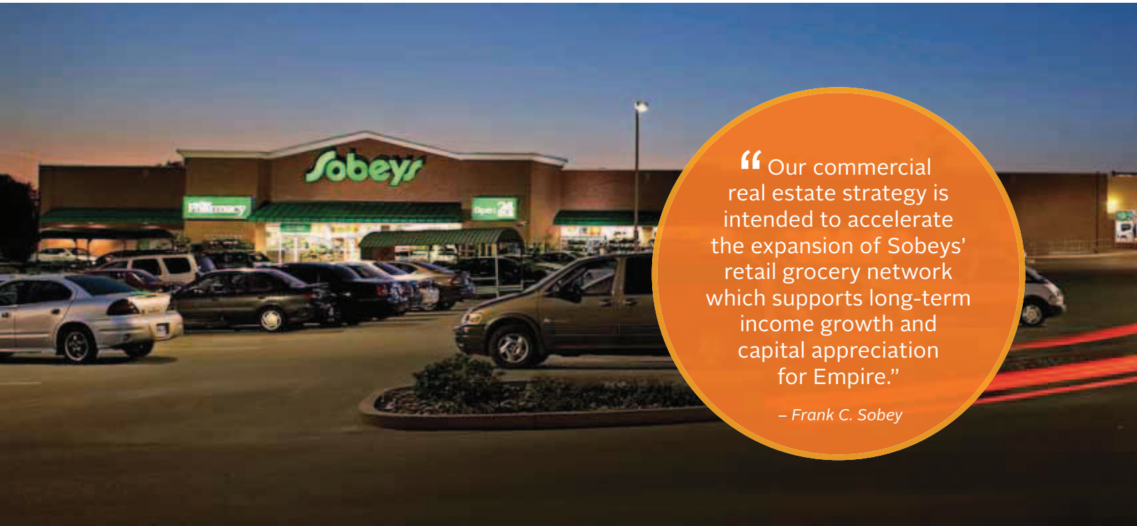
Property owned and operated by Crombie REIT.

REIT's strengths is its unique and mutually beneficial relationship with Sobeys. During fiscal 2011, Crombie REIT purchased 12 new free-standing and food-anchored properties for $104.0 million from Sobeys and subsidiaries of Empire. Sobeys and Crombie REIT work closely together throughout the development stage of all properties to ensure they meet the long-term interests of both organizations. For Sobeys, this ensures well-managed and well-maintained premises and the potential flexibility to expand or renovate when required. For Crombie REIT, the relationship ensures preferred access to new, high-quality properties that serve the everyday needs of local communities. At the end of fiscal 2011, Crombie REIT had first option on an additional 22 Sobeys properties representing $400 to $500 million of future acquisitions in the pipeline.