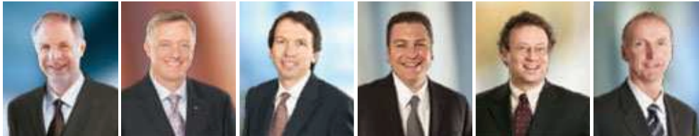
Robert P. Dexter Chair